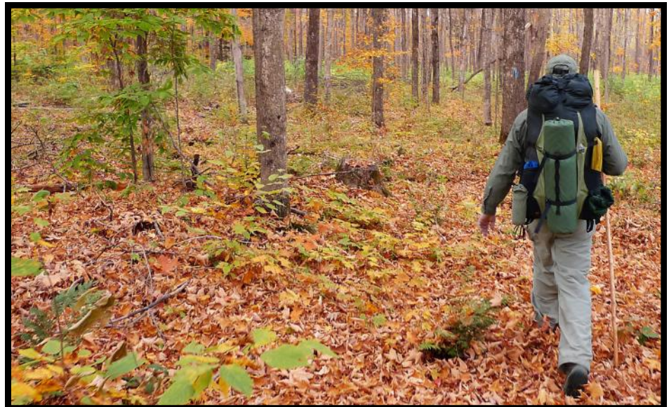
Hiking along the NCT towards Eagle Lake, in Michigan's northern lower peninsula.

In the past few years, however, I've noticed a change. More and more hikers not only know that they're on the NCT, but they can talk about other sections that they've hiked. They'll reminisce about getting lost in a thick and poorly maintained corner of the western UP, or about what a great time they had hiking the trail between lakes Michigan and Superior. Moreover, they've got plans to hike new sections of the trail - perhaps a hike across the UP, or one that covers the 1130+ Michigan miles. The exotic vacation they're talking about is along the NCT, not somewhere out in the Rockies, or down south.