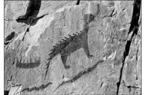
The petroglyphs above can be viewed by walking out on the rocky shore using cables and ropes to stay safe, below left. View of Orphan Lake below.

rain showers, and we left the crowds behind at the Mackinaw Bridge. Once we crossed the border into Canada, it was obvious that we were in a very different place from the Lower Michigan landscape we're used to. Our hikes took us past pristine Lake Superior coastline, to large waterfalls on the Sand River, to ancient petroglyphs on rock cliffs. A highlight of the trip was the Orphan Lake trail, which had a number of spectacular overlooks, waterfalls, and huge mossy boulders. The rocks in the trail and sometimes steep elevation changes were worth it — our views of Orphan Lake and Lake Superior could go on a postcard. Driving between trails, a few people saw a black bear and a moose alongside the road. Despite the fact that daylight remained late into the evening, we enjoyed campfires most nights.