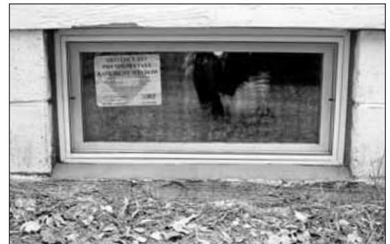
Gene Schmidt, top photo, and Tom Birdsall, middle photo installing new windows in the Birch Grove Schoolhouse.