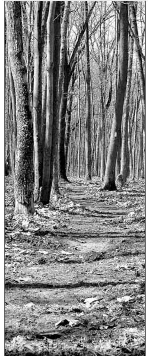
Freshly groomed trail, cut during Spring Clean-up Day on April 19, connects the Highbanks Lake campground to the North Country Trail. On this sunny day the ice was breaking up on the lake and the snow was nearly gone from the campground road by the end of the work day.

Best Season: Excellent in the fall (maples), good year round.