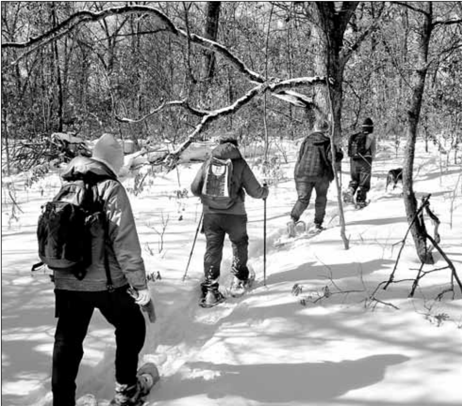
A brilliant day for snowshoeing on the Birch Grove Trail.