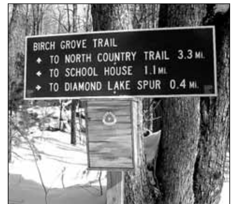
Trail register station along the Birch Grove Trail.

The potluck provided the perfect finish, with great stews and chili, crusty bread, garlicky guacamole, and some found red wine.