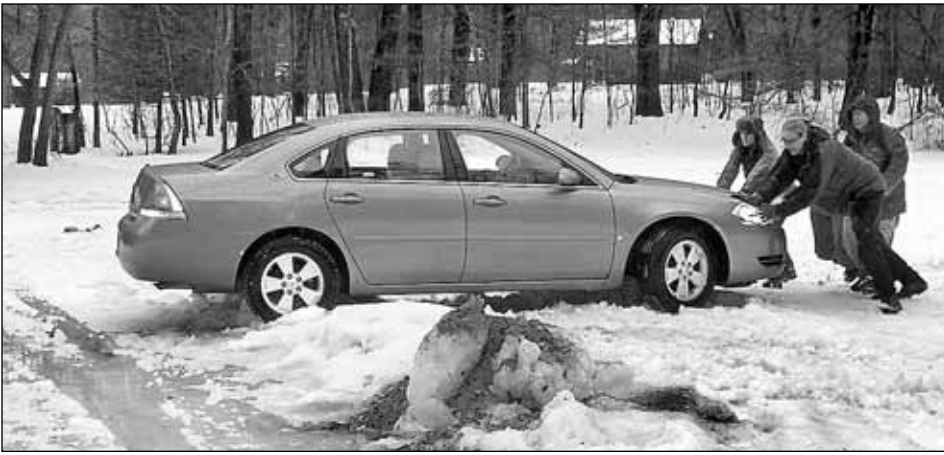
Pushing out for the drive home.