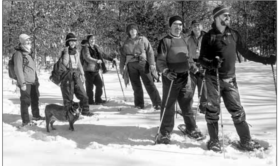
Finally, a group was able to use snowshoes at the annual snowshoe day rather than just hiking in boots due to lack of snow.