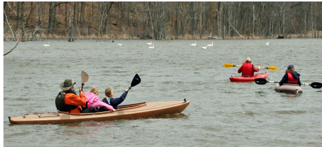
Kayak birding next to the Trail.

For further information and details, see the Festival web site and Facebook page or contact Jean at 616 293-8666 or Cal at 269 720-6983.