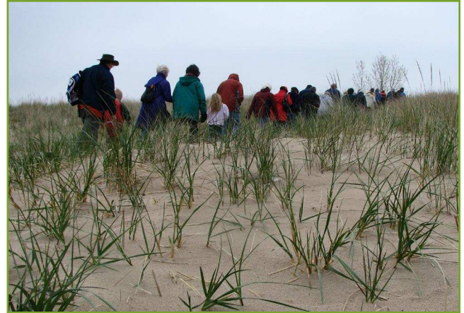
Above: Earth Day Celebration attendees embark on a guided hike through the Saugatuck Harbor Natural Area.