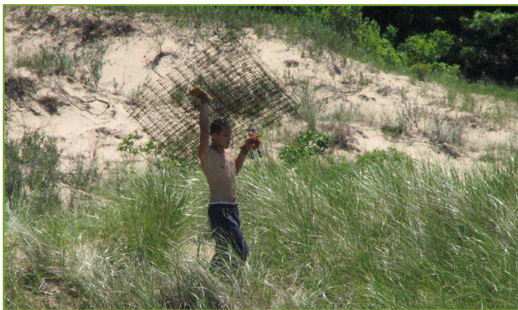
Left: Fencing being removed from the property.