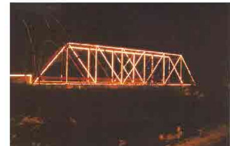
Bridge Park Holiday Lights

Each year during the holidays, Historic Bridge Park celebrates by lighting the bridges. Experience the scenic nature of Historic Bridge Park, its bridges and the Kalamazoo River.