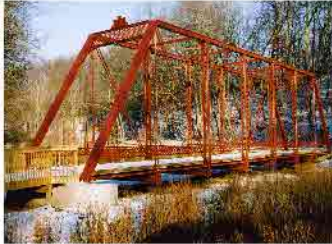
Restored Gale Road Bridge

Formerly known as "County Park", Historic Bridge Park is located on Wattle Road and along the Kalamazoo River in Emmett Township, southeast of Battle Creek, Michigan.