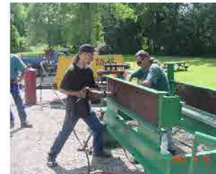
Living History Demonstration

manufacturing and industrial building techniques such as riveting, forge welding and blacksmithing.