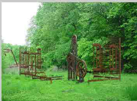
Sculpture of Bridge Shop

Historic Bridge Park is home to bridges that feature a variety of truss designs and manufacturing techniques dating back to the late 1800's and early 1900's.