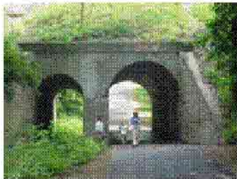
Dixon's Bridge and County Linear Trailway

The park is a passive recreation area with a network of non-motorized trailways and restored historic bridges. It serves as the trailhead for the County Linear Trailway, as well as a segment of the National Park System's North Country National Scenic Trail.